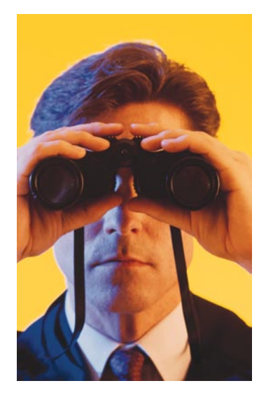
"Users of this system should execute a daily scanning and screening of the Correlation database to keep abreast of all current opportunities."

Notice: There is a serious risk of loss in stock and futures trading. CSI does not recommend any specific trading pursuit. Each trader must carefully examine his or her own financial situation and risk tolerance before taking on any trade. Never risk more than you can afford to lose. Traders should thoroughly check out what we report and verify your own comfort level with any trading system before entering into a trading situation.