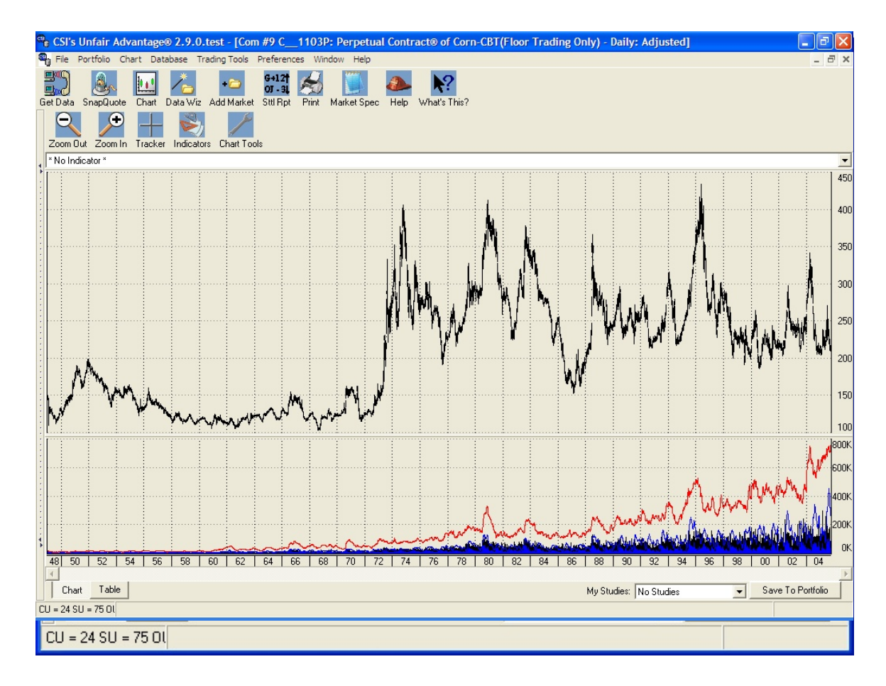
CSI's unsurpassed historical database holds CBT Corn data to 1949. Here UA shows the entire series in highly compressed Perpetual Contract® data form.

In the U.S. we use mostly traditional contracts that assign a fixed, future calendar date for delivery of the product. In such transactions, the seller hopes that the market price might fall before the delivery date, so that the amount collected for the commodity will be greater than its value upon delivery. Conversely, the buyer hopes that the price will rise so that the commodity will have been purchased at a bargain, or at the very least, a price comparable to the cash market at the time of delivery. Speculators take positions on either side of this transaction, with the hope of liquidating the contract for a profit before being faced with delivery of the actual product.